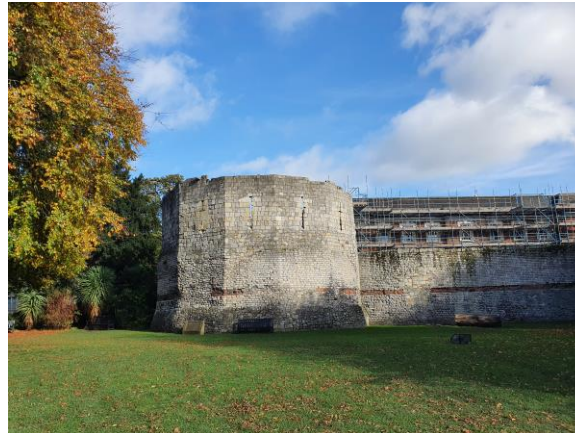
Multangular Tower and Roman Wall in the Museum Garden - Photo Credit: JU