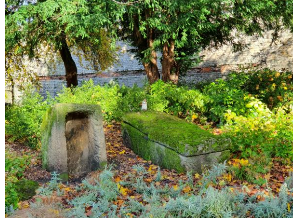
Sarcophagi in the Museum Gardens