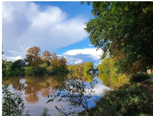
View from New Walk