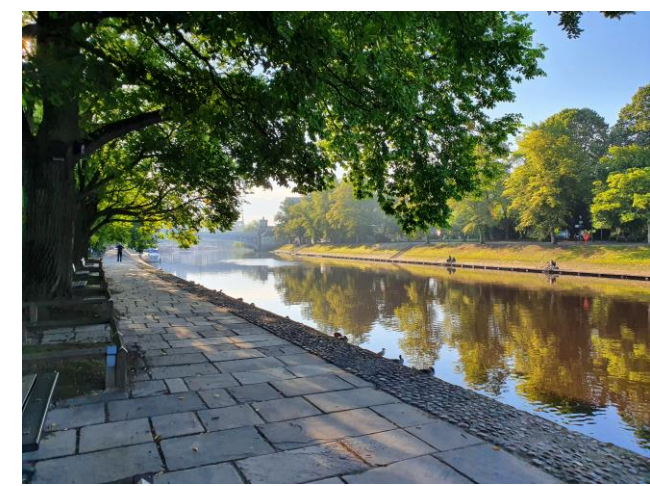
View from near Marygate